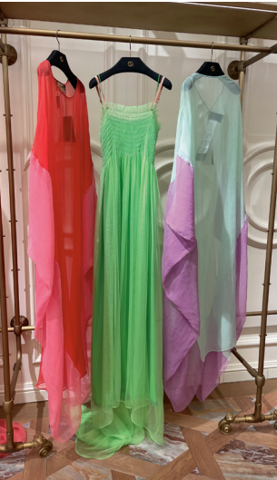
Gucci pull for event styling